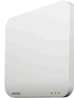
MXWAPT Access Point Transceiver